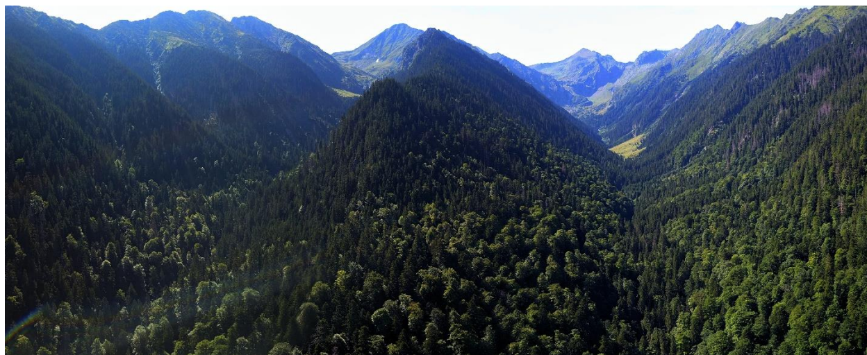
Image 1: Arpas Valley, Fagaras Mountains: only partially in the National Catalogue (the top part)

The systemic failure of the “National Catalogue of Virgin and Quasi-virgin Forests” of Romania