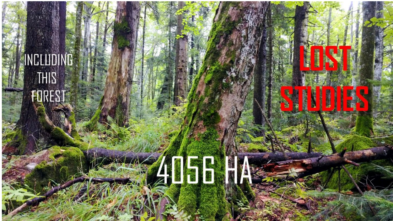
Image 2: A forest in Moldova listed by the Forest Guard as sent to the Ministry, but missing from the Ministry list