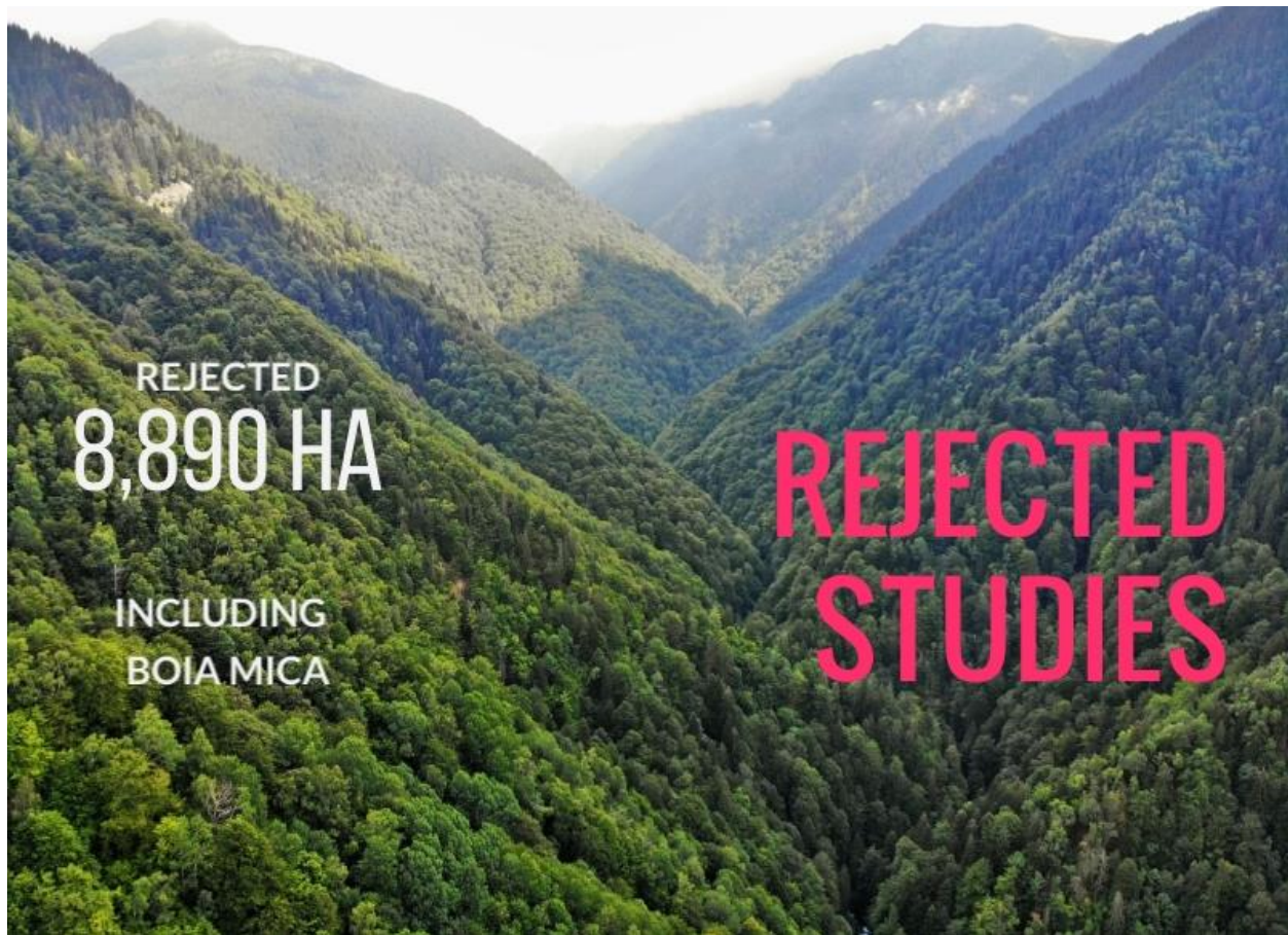
Image 4: Over 1000 hectares of intact primary forests in Boia Mica valley, Fagaras Mountains

This is a clear conflict of interest as each study that contradicts a forest management plan is seen by this commission as invalidating the approvals initially given by them.