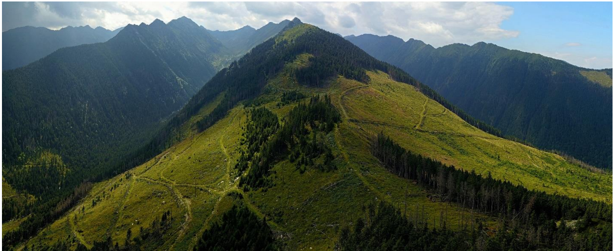
Image 5: Large clear cuts in former primary and old growth forests. Ucea valley, Fagaras Mountains

These findings clearly show that the National Catalogue of Virgin and Quasi-virgin Forests is not fit for the purpose of conserving the majority of primary and old-growth forests in Romania.