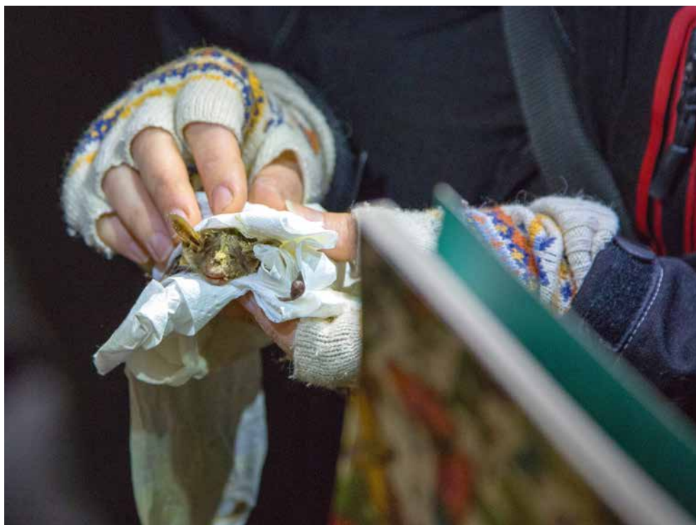
Anna Bator-Kocoł carefully dries the fur of the fallen bat. It was presumably from this cluster of greater mouse-eared bats (righthand picture) that the exhausted bat fell.