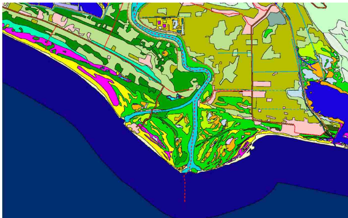
Fig. 2. Habitat Map of the Ada Island, Reserve Velipoja and the Eastern part of Velika Plaza – an unique natural area in the Mediterranean.

Large prime natural areas in Europe were not protected by nature conservation authorities, but as border regions controlled by military and border control. Beside the Iron Curtain, the Albanian border very strictly controlled and without access to the public. The Ada Island and the Bojana River is one of the best examples how this borders restricted development and