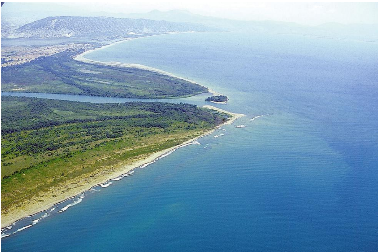
Fig. 1. Ada Island, Reserve Velipoja and the Bojana River: Protected Natural Heritage of Global Importance in Montenegro and Albania