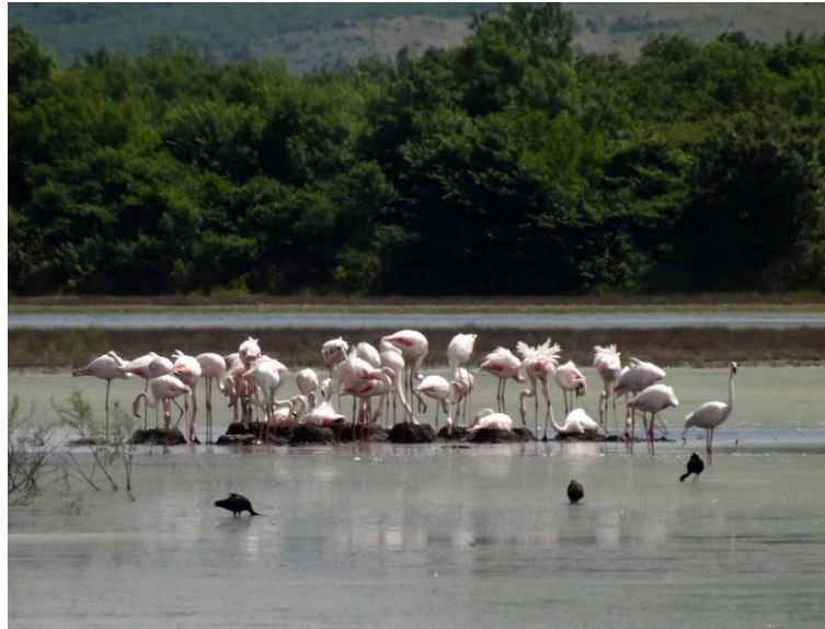
Figure 3 – These nests of Greater Flamingos ( Phoenicopterus roseus ) were wilful destroyed in summer 2013

This situation brought many negative consequences for birds. In May 2014 due to high water level flamingos had to give up their breeding. It was all the more sad that more than 1,500 animals were at the time in the saline. The Ulcinj Salina filled with freshwater does not have such as high biotope's diversity and does not produce the same amount of biomasses of arthropods and other invertebrates as a functioning saline, so that the food supply for wildlife is lower. Despite the fact that in 2014 heavy rains caused problems in next years another problem may occur. Namely that there is too little water in the summer and that succession will overgrow the Saline.